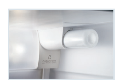
Best-in-Class Ice & Water Filtration<sup>2</sup> PureSource Ultra™ Water Filtration offers best-in-class water filtration so you get cleaner, better-tasting water at your fingertips.