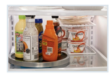
Most Usable Shelf Space<sup>1</sup> Our adjustable shelves have room to