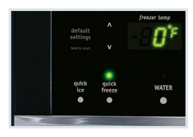
Quick Ice3 Quick Ice delivers up to 37 percent more ice

Our SpaceWise™ organization system makes it easy to keep food organized and easy to find when you need it.