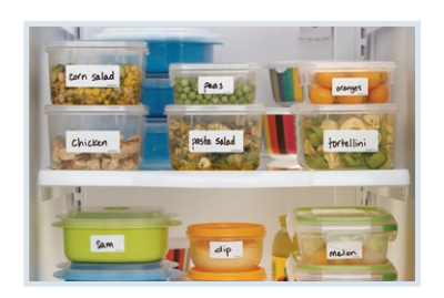
SpaceWise™ Organization System

Our SpaceWise™ organization system makes it easy to keep food organized and easy to find when you need it.