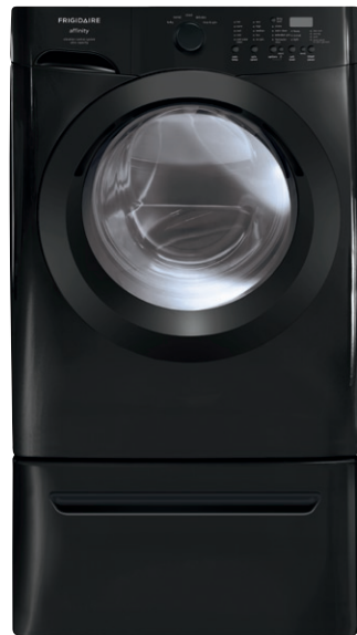
Optional SpaceWise® Pedestal Drawer Shown