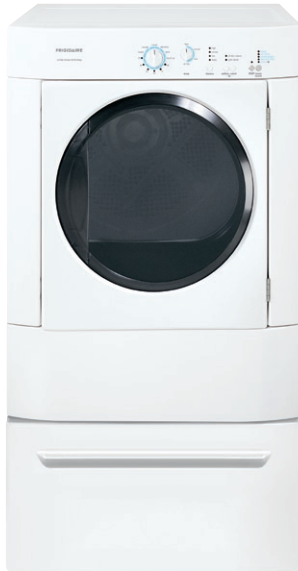
Optional Pedestal Drawer Shown