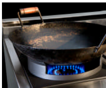
Cast Iron Wok Grate Accessory