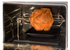
Motorized Rotisserie System