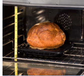
Large Oven Capacity