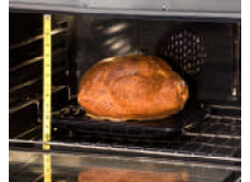
Large Oven Capacity