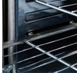
Capital exclusive feature: Flex-Rolls oven racks