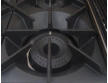
High Quality Porcelainized Top Grate