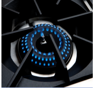
Simmer turning down to give 145° F