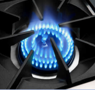
Power-Flo OpenTop Burner 23,000 btus/hr