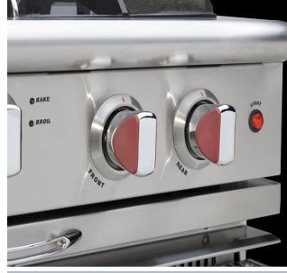
Optional Cabernet red knobs