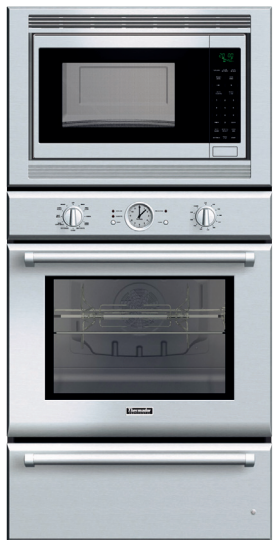
Professional Series stainless steel microwave/warming drawer triple combination oven.