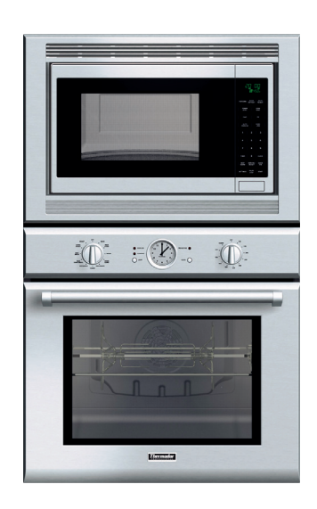
Professional Series stainless steel microwave double combination oven.