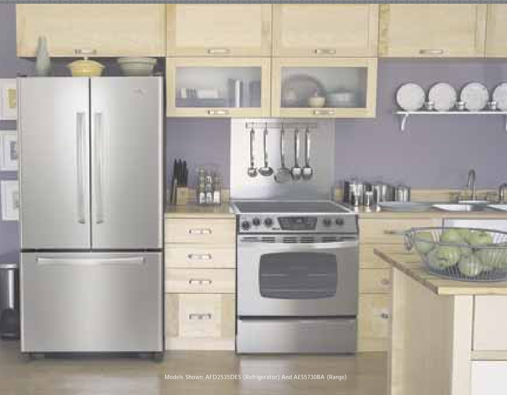
Models Shown: AFD2535DES (Refrigerator) And AES5730BA (Range)