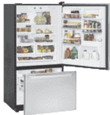
ABB1927DE ABB2527DE (NOT PICTURED) Features similar to ABB2227DE. ABB1927DE has 18.5 cu. ft. capacity; fits 30"-wide cabinet opening. ABB2527DE has 25.1 cu. ft. capacity; fits 36"-wide cabinet opening.

ABB1924DE ABB2524DE (NOT PICTURED) Features and colors similar to ABB2224DE. ABB1924DE has 18.5 cu. ft. capacity; fits 30"-wide cabinet opening. ABB2524DE has 25.1 cu. ft. capacity; fits 36"-wide cabinet opening.