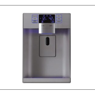
Quick and easy access to filtered water and cubed/crushed ice at your fingertips with the external dispenser.