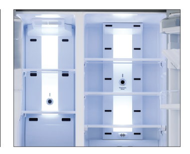
Tower Lighting evenly distributes bright light throughout the refrigerator and freezer compartments.

Design and specifications are subject to change without notice. Non-metric weights and measurements are approximate.