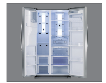
Side by Side configuration provides easy access to food in both refrigerator and freezer compartments.

Dimensions: (WxHxD) (With Detached Handles): 38<sup>5</sup>/<sub>16</sub>" x 75<sup>1</sup>/<sub>8</sub>" x 31<sup>3</sup>/<sub>8</sub>" Weight: 284.5 lbs/129 kg