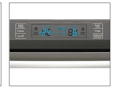
External digital console makes it easy to adjust the temperature.

Design and specifications are subject to change without notice. Non-metric weights and measurements are approximate.