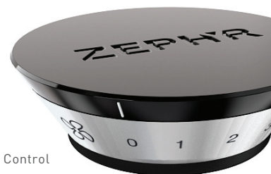
RF Remote Control