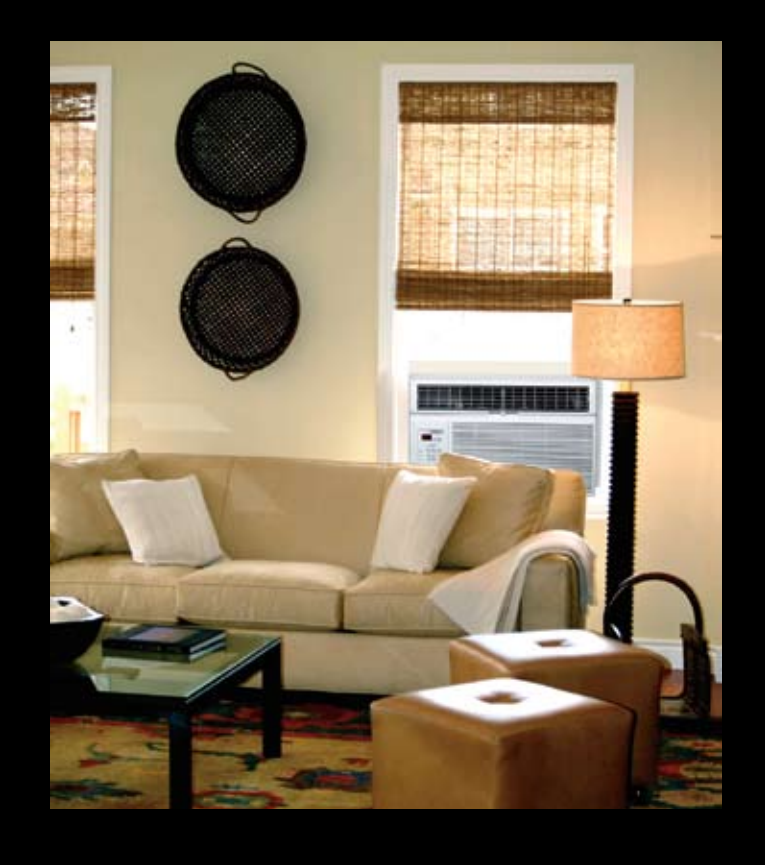
ROOM AIR CONDITIONERS COOL ONLY | HEAT PUMPS | ELECTRIC HEAT