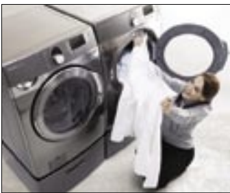
Sensor Drying Technology