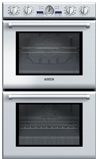
Professional Series Deluxe stainless steel double oven with electronic display.