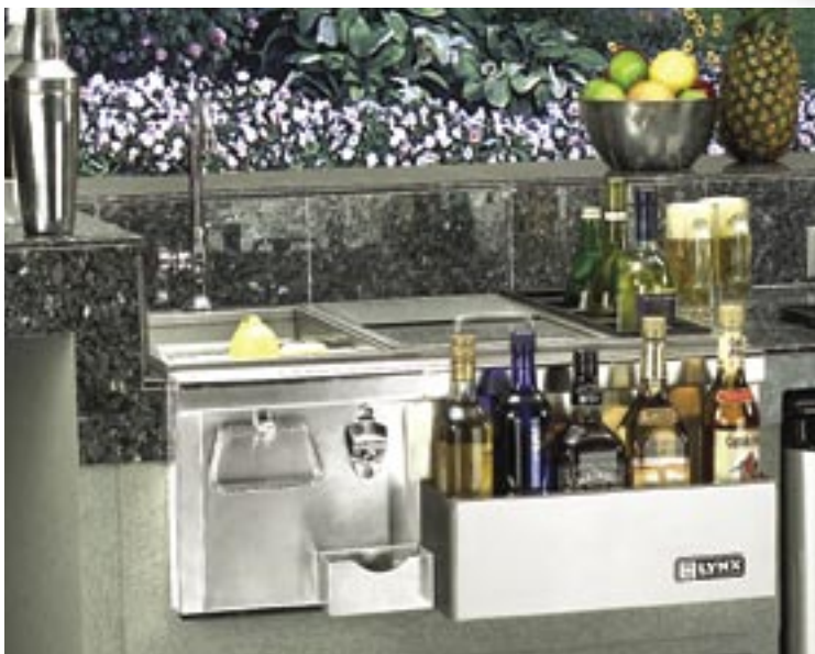
As shown Model CS30