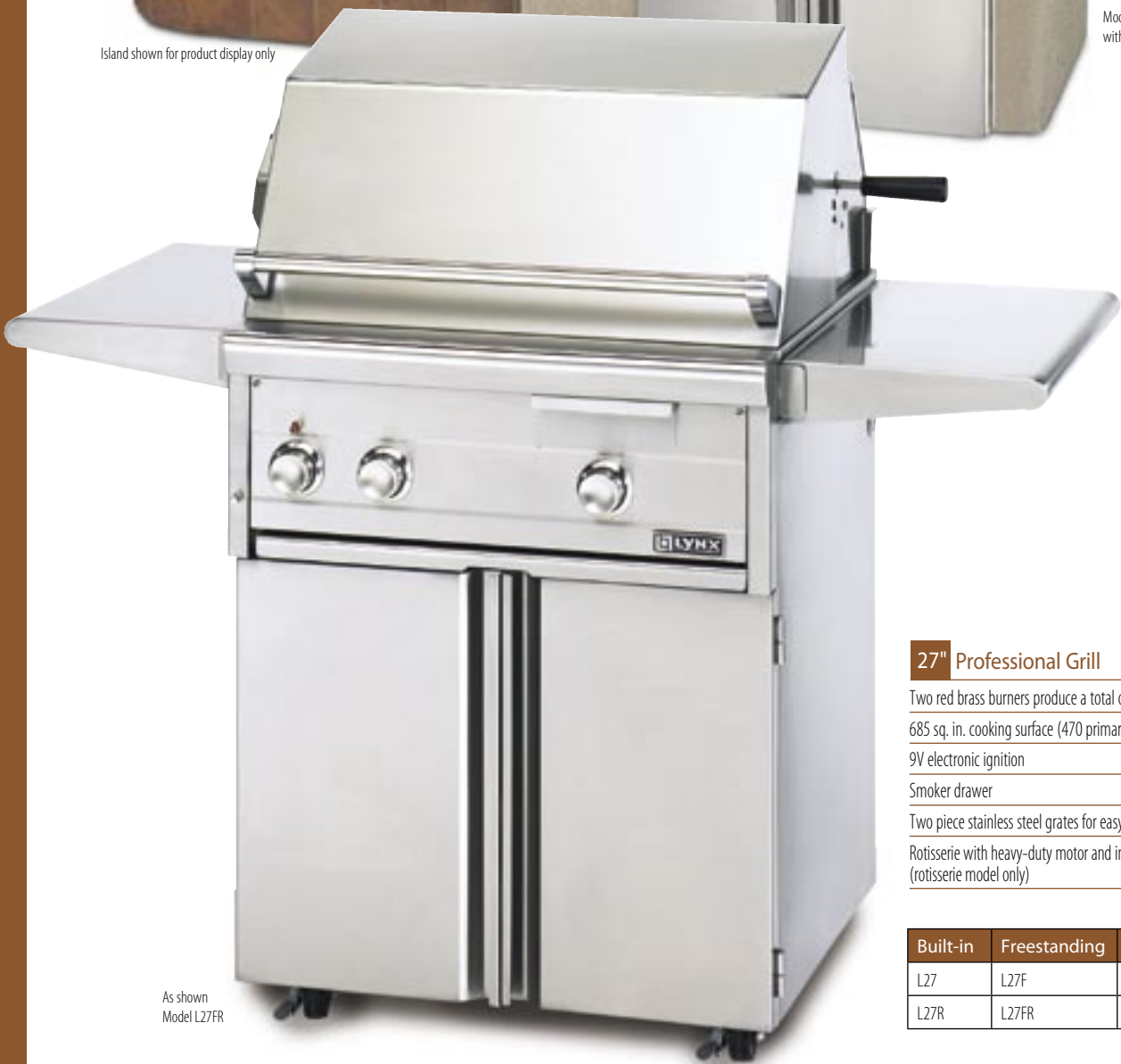
As shown Model L27FR