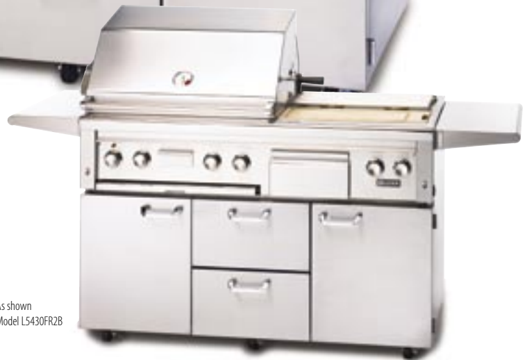
As shown Model L5430FR2B