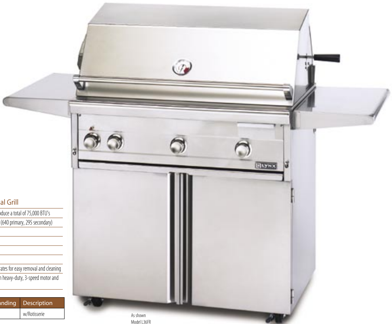
As shown Model L36FR