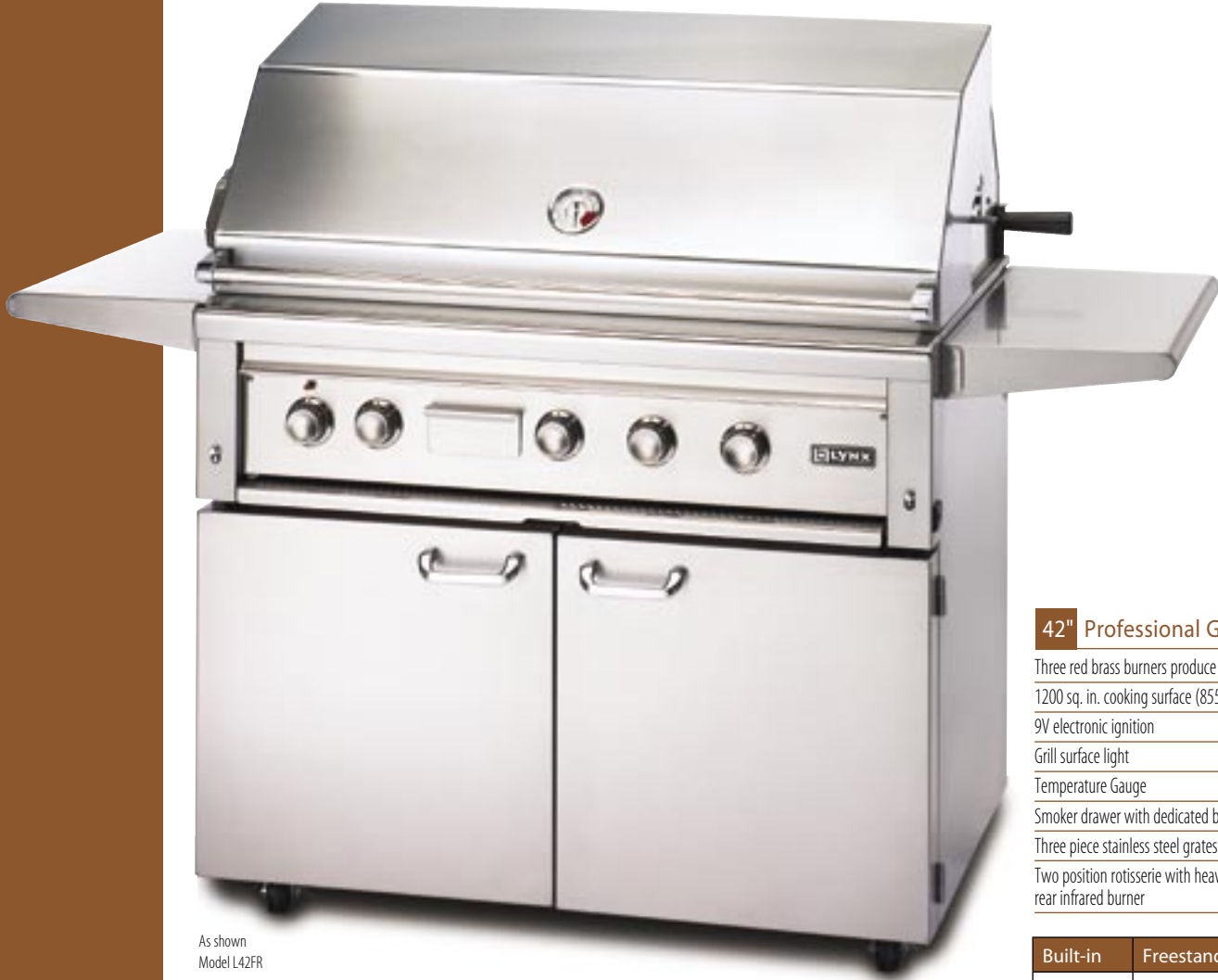
As shown Model L42FR