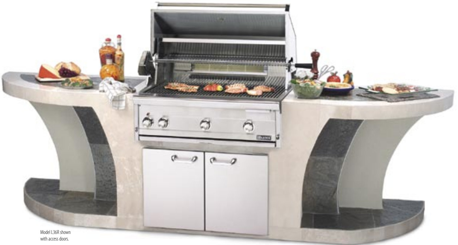
Model L36R shown with access doors.