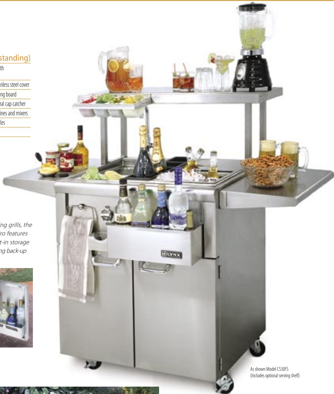
As shown Model CS30FS (Includes optional serving shelf)

Just like our freestanding grills, the freestanding CocktailPro features access doors with built-in storage shelves. Ideal for keeping back-up liquors and mixers.