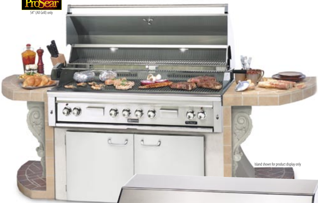
Island shown for product display only