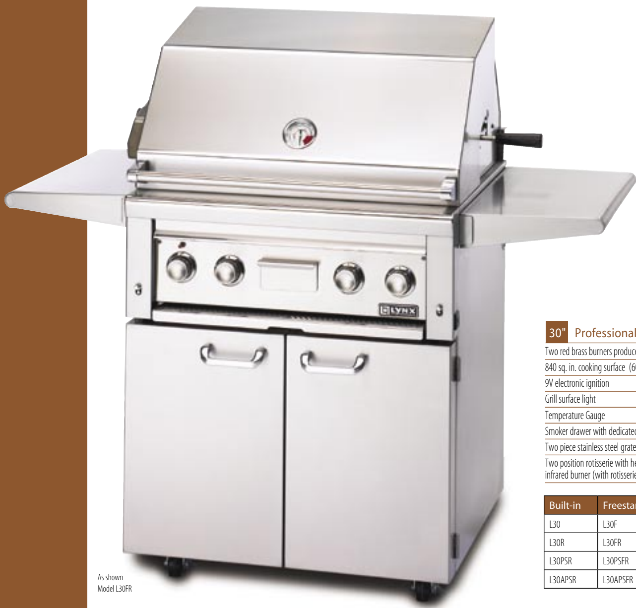
As shown Model L30FR