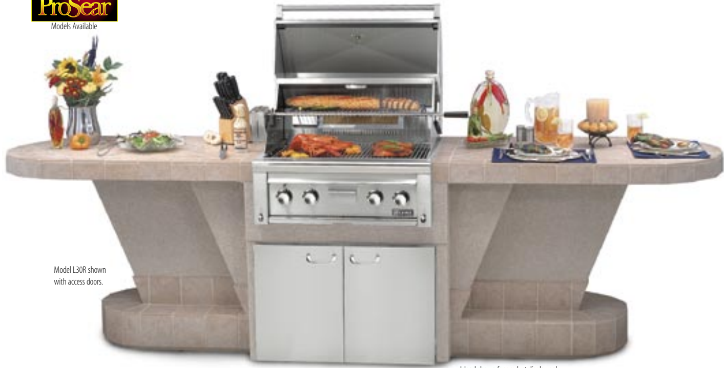
Model L30R shown with access doors.