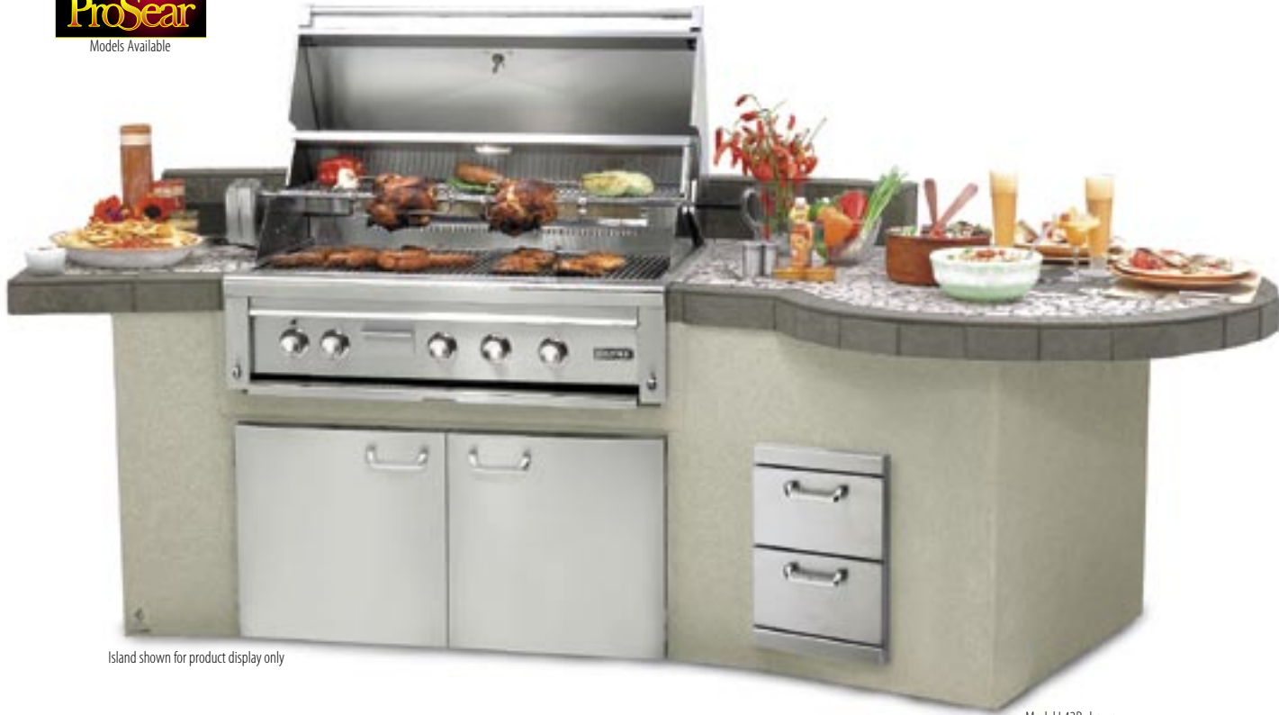
Island shown for product display only