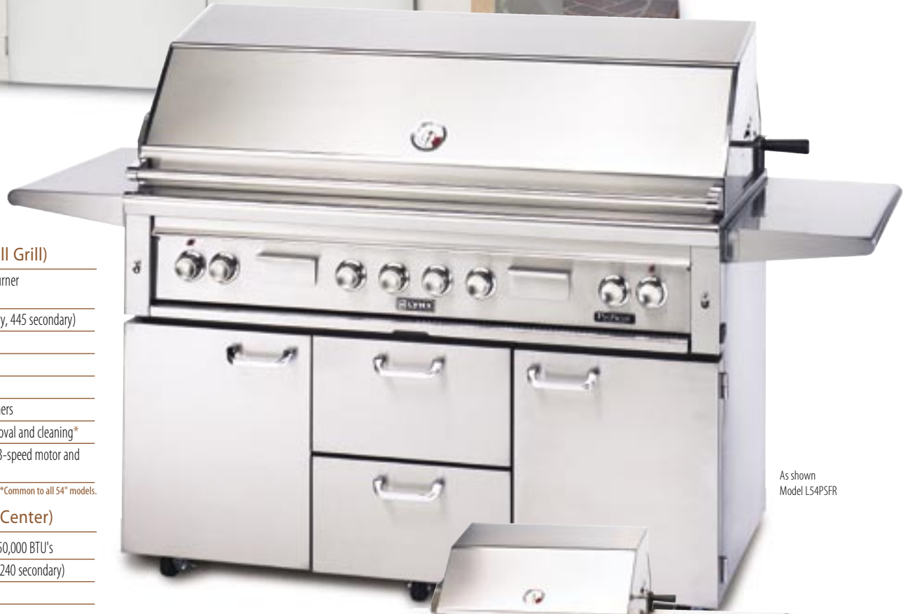
As shown Model L54PSFR