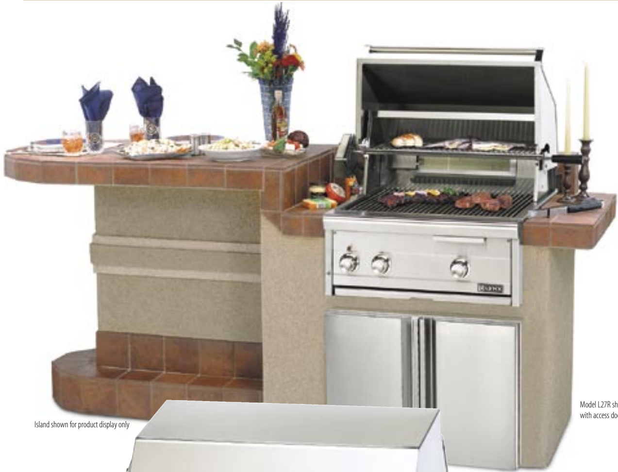
Island shown for product display only