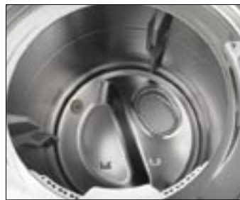
Large 7.4 cu. ft. Capacity and Stainless Steel Drum