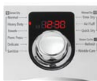
Easy to Use Controls with Pre-Programmed Cycles