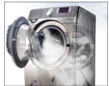
Steam Drying Technology

Design and specifications are subject to change without notice. Non-metric weights and measurements are approximate.