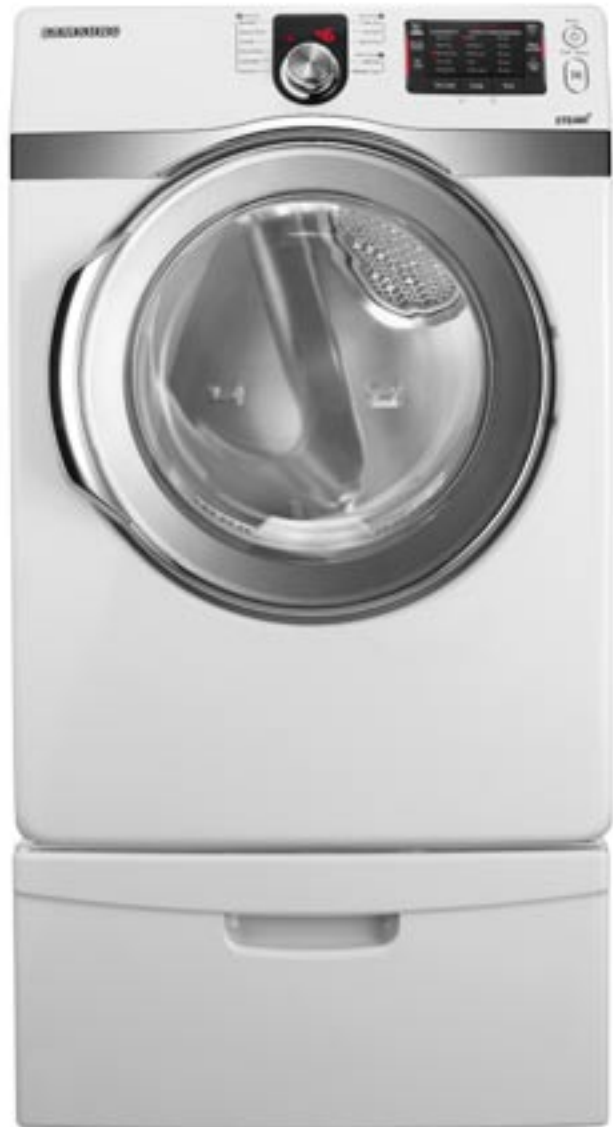
(Shown with optional pedestal)

Samsung Steam Dryers offer Steam Refresh and Steam WrinkleCare cycles, which use steam to reduce wrinkles and refresh clothing.