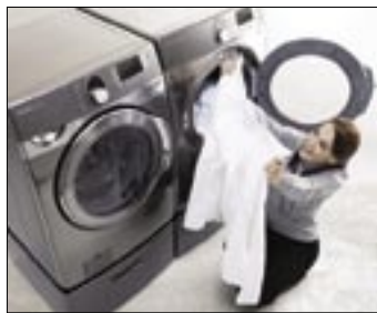
Sensor Drying Technology