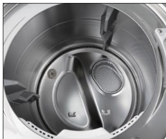
Large 7.3 cu. ft. Capacity and Stainless Steel Drum