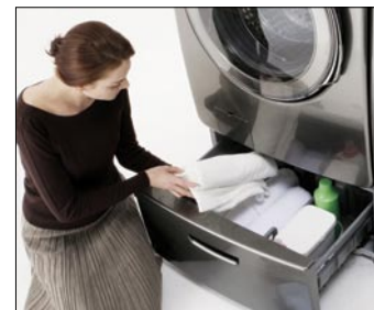
Optional Convenient 15" Pedestal

Design and specifications are subject to change without notice. Non-metric weights and measurements are approximate.