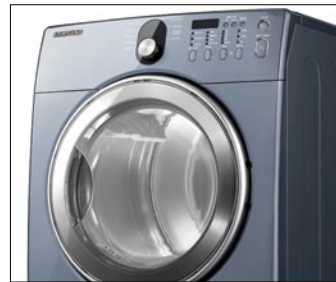
Graphic LED Digital Controls