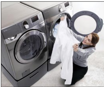
Sensor Drying Technology