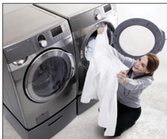
Sensor Drying Technology