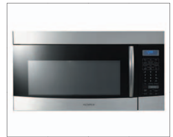
Stylish design complements other Samsung kitchen appliances.

Actual color may vary. Design, specifications, and color availability are subject to change without notice. Non-metric weights and measurements are approximate.