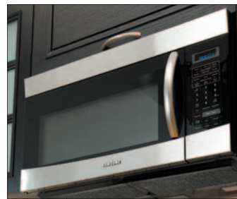
Powerful 400 CFM ventilation fan quickly and quietly eliminates food odors.