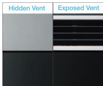
Stainless steel with a hidden vent provides a clean finish.