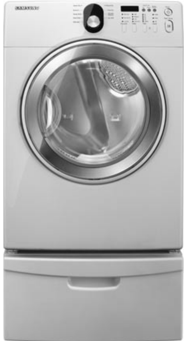
(Shown with optional pedestal)

Samsung DV218 dryer offers sensor drying technology and a Wrinkle Prevent option to reduce wrinkles and refresh clothing.