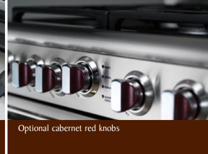
Optional cabinet red knobs