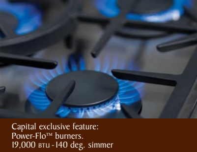
Capital exclusive feature: Power-Flo™ burners. 19,000 BTU - 140 deg. simmer