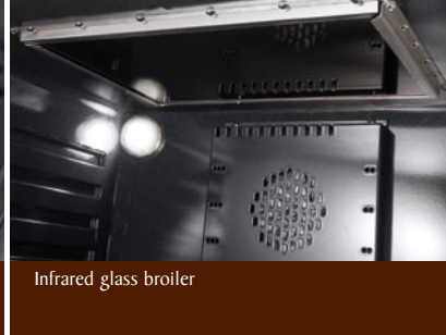
Infrared glass broiler