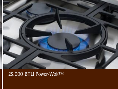
25,000 BTU Power-Wok™