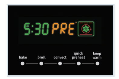
Quick Preheat Preheat in less than six minutes.<sup>1</sup>