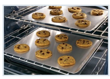
True Convection Multi-rack baking is faster and more even with True Convection.