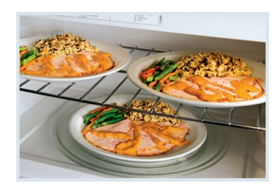
Fits-More™ Microwave Extra-large microwave provides 2.0 cubic feet of cooking space.