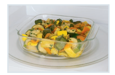
Effortless™ Reheat Reheat almost anything at the touch of a button.