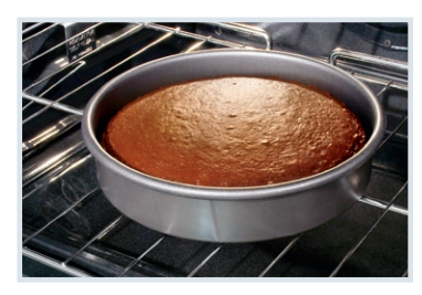
Even Baking Technology Our latest technology ensures even baking every time.