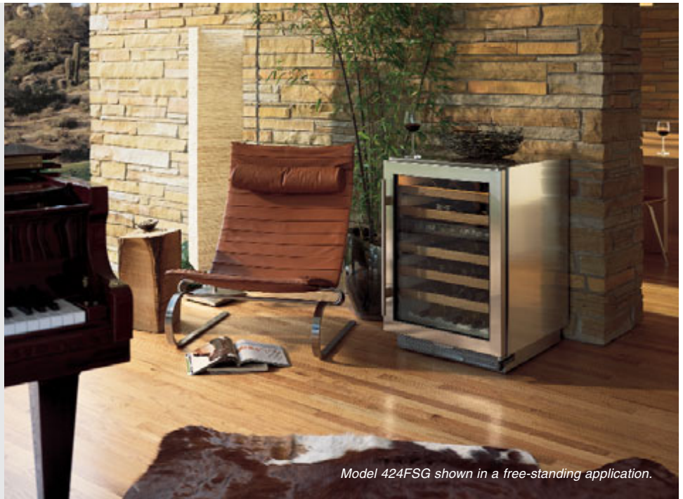
Model 424FSG shown in a free-standing application.

Better wine storage conditions for the bottle ultimately means better enjoyment in the glass. Free-standing Model 424FS has a wine storage capacity of 46 (750 ml) bottles. Two independent storage zones maintain the temperature and humidity that wine – and wine lovers – require. The exterior is completely clad in classic stainless steel for a free-standing application.