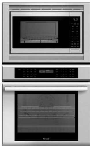
Masterpiece Series stainless steel combination with a microwave and True Convection oven.