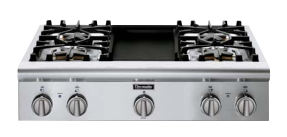
PCG364ED Professional Series 36" cooktop with 4 Star Burners (2 with ExtraLow® feature) and Electric Griddle.