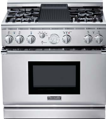
Pro-Grand 36" (LP) Liquid Propane Range 4 Burners with Grill