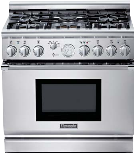
Pro-Grand 36" Dual-Fuel Range with 6 Burners