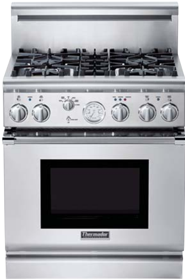
Pro-Grand 30" Dual-Fuel Range with 4 Burners