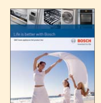
Full Line Brochure