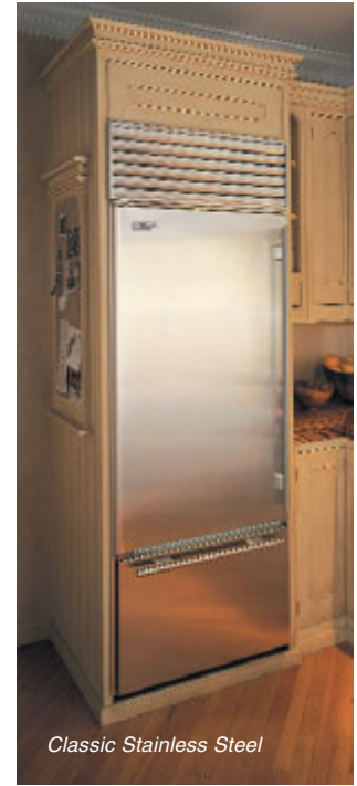
Classic Stainless Steel