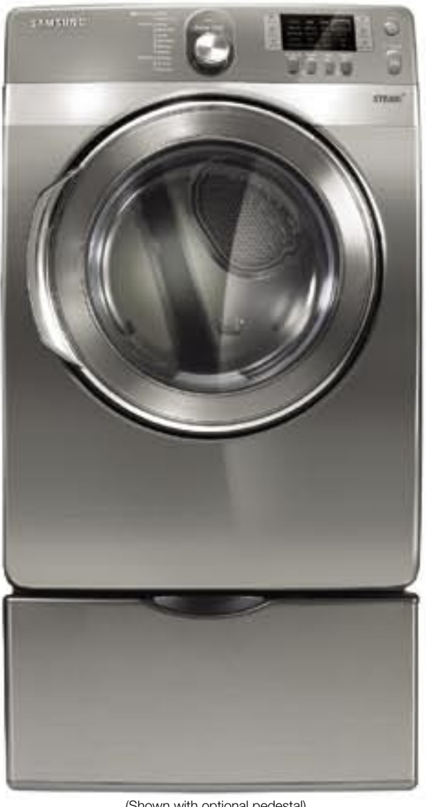
(Shown with optional pedestal)

Samsung Steam dryers offer Steam Refresh and Steam WrinkleCare cycles which use steam technology to reduce wrinkles and refresh clothing.