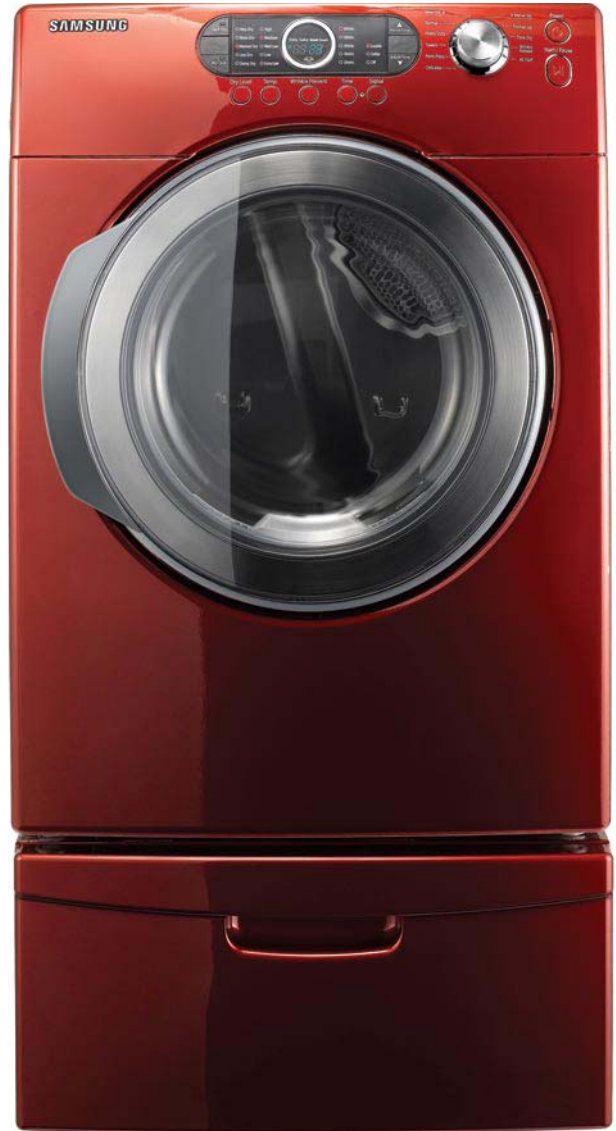
(Shown with optional pedestal)

Samsung DV328 dryer offers sensor drying technology and a Wrinkle Prevent option to reduce wrinkles and refresh clothing.