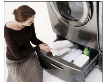
Optional Convenient 15" Pedestal

Design and specifications are subject to change without notice. Non-metric weights and measurements are approximate.