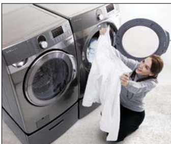
Sensor Drying Technology