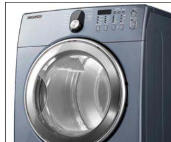
Graphic LED Digital Controls