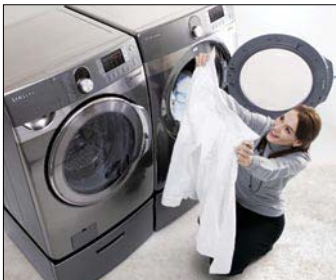
Sensor Drying Technology