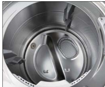
Large 7.3 cu. ft. Capacity and Stainless Steel Drum