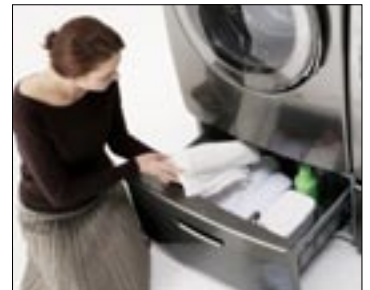
Optional Convenient 15" Pedestal

Design and specifications are subject to change without notice. Non-metric weights and measurements are approximate.