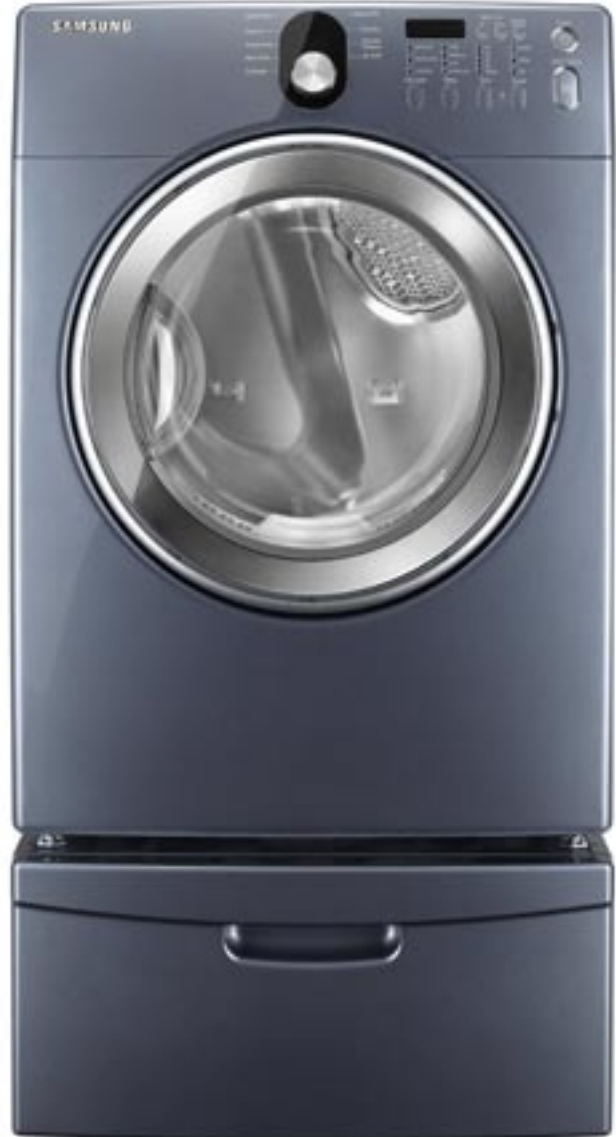
(Shown with optional pedestal)

Samsung DV218 dryer offers sensor drying technology and a Wrinkle Prevent option to reduce wrinkles and refresh clothing.