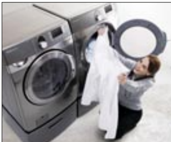
Sensor Drying Technology