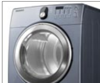
DOT LED Center Jog Dial