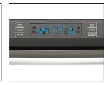
External digital console makes it easy to adjust the temperature.

Design and specifications are subject to change without notice. Non-metric weights and measurements are approximate.