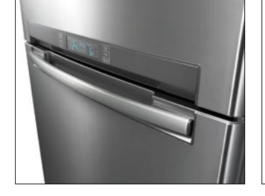
EZ-Open Handle<sup>™</sup> lifts the handle to open the freezer with no force needed.