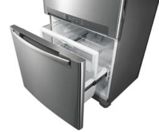
Auto Pull Out<sup>™</sup> drawer for easy access.