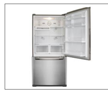
Bottom freezer design provides easy access to fresh food and flexible storage options.