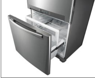
Auto Pull Out<sup>™</sup> drawer for easy access.