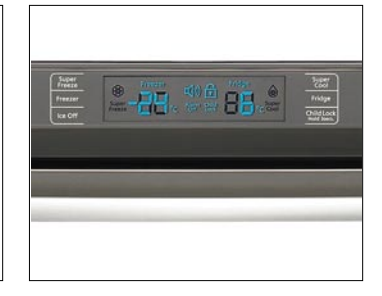
External digital console makes it easy to adjust the temperature.

Design and specifications are subject to change without notice. Non-metric weights and measurements are approximate