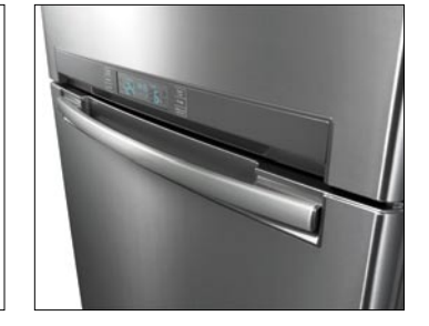
EZ-Open Handle<sup>™</sup> lifts the handle to open the freezer with no force needed.