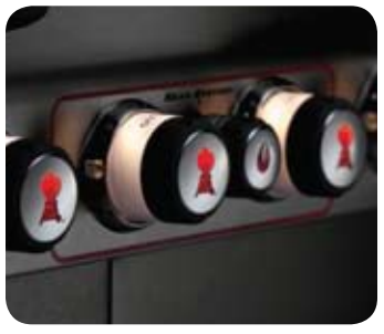
Lighted control knobs allow you to fine tune heat settings, even in low light conditions.