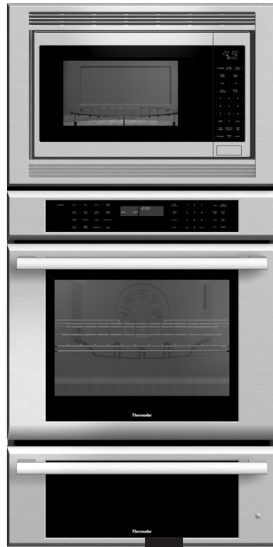
Masterpiece Series stainless steel combination oven with microwave, True Convection oven and warming drawer.