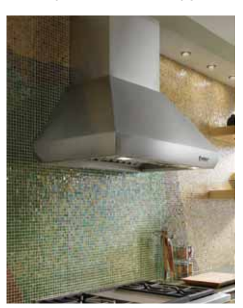
PRO WALL CHIMNEY HOOD