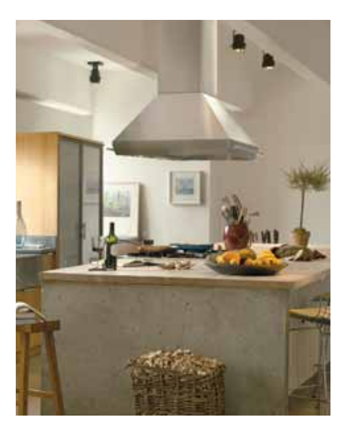
PRO ISLAND HOOD