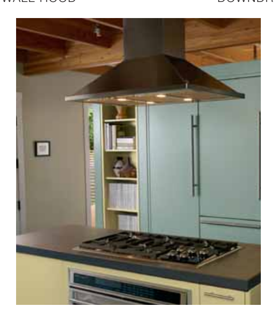
COOKTOP ISLAND HOOD