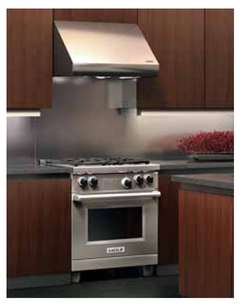
PRO 27" DEEP WALL HOOD

Internal, inline, or remote blower options from 500 to 1,500 cfm