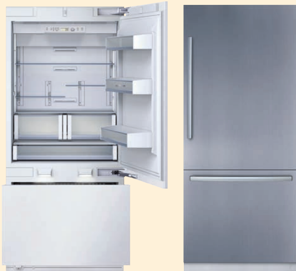
Integra Freezer B36IB70SSS – Stainless Steel B36IB70NSP – Custom Panel