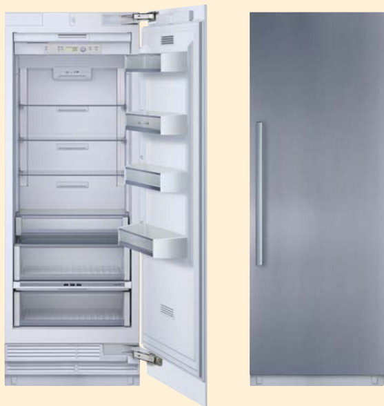
Integra Refrigerator B30IR70SSS – Stainless Steel B30IR70NSP – Custom Panel