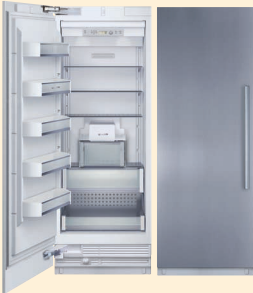
Integra Freezer B30IF70SSS – Stainless Steel B30IF70NSP – Custom Panel