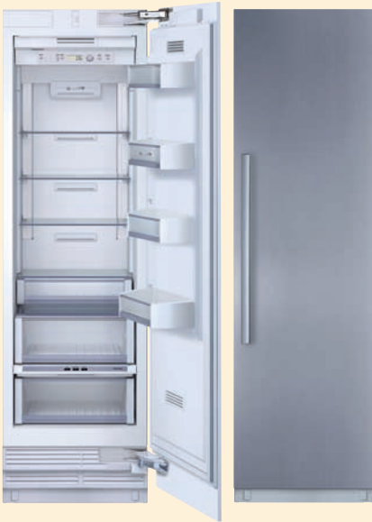
Integra Freezer B24IR70SSS – Stainless Steel B24IR70NSP – Custom Panel