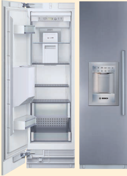
Integra Freezer B24ID80SL/RS – Stainless Steel B24ID80NL/RP – Custom Panel