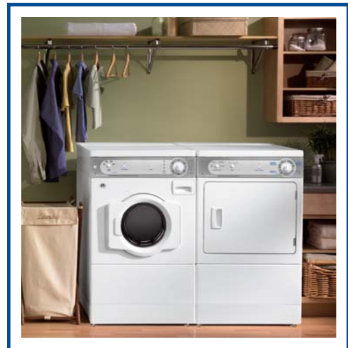
Speed Queen Frontload Washers can be raised on an optional 8" pedestal. (Sold separately. Part number PDR108W)